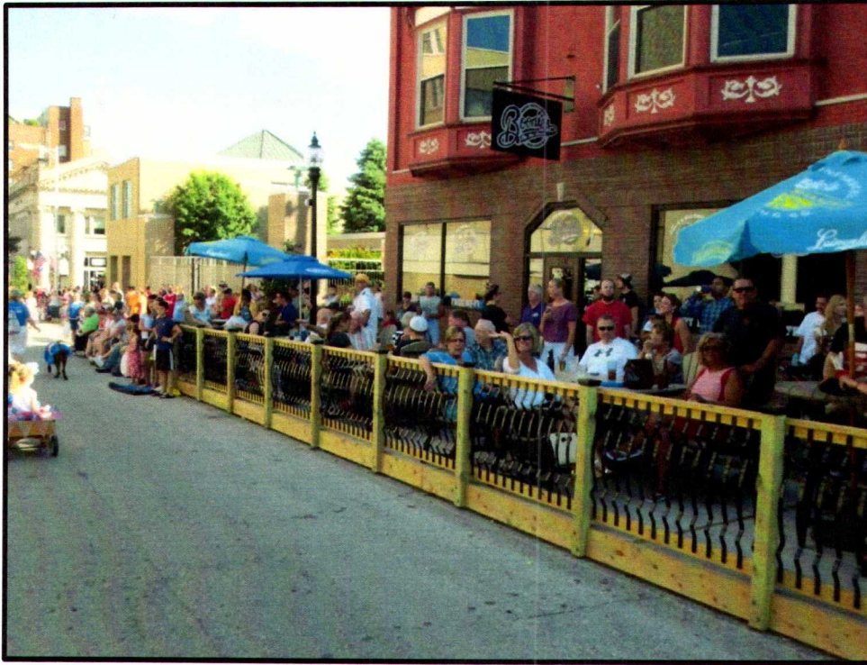
On street dining at Boonie's On the Avenue in a Previous Year